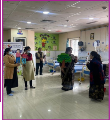
GET WELL SOON cards from little ones of PANCHHI PLAY SCHOOL